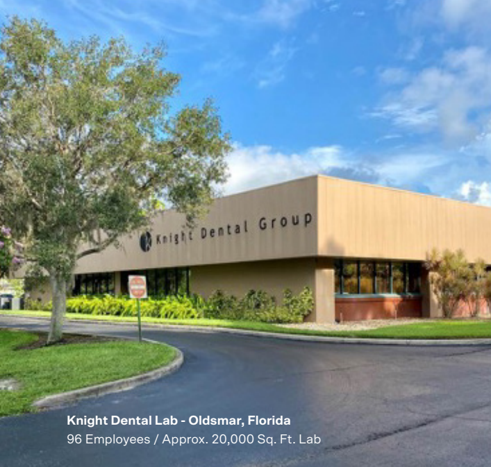
Knight Dental Lab - Oldsmar, Florida 96 Employees / Approx. 20,000 Sq. Ft. Lab